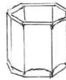
Rocks Glass (9.0)